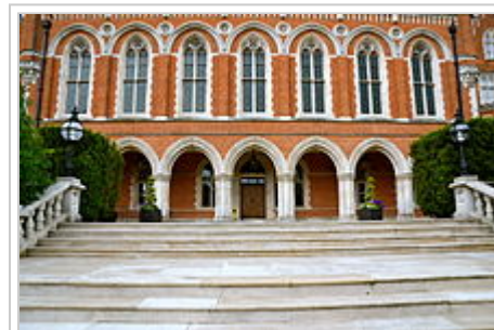
Holloway Sanatorium steps which features in the video

The music video for "Total Eclipse of the Heart" was directed by Russell Mulcahy [17] and was filmed on location at the Holloway Sanatorium, a large Victorian Gothic hospital near Virginia Water, Surrey, England. [18] The video features Bonnie Tyler clad in white, dreaming or fantasizing about her students in a boys' boarding school. Young men are seen dancing and participating in various school activities and singing in a choir. A long-running urban legend is that the boy who appears throughout the video and who shakes Tyler's hand at the end is former Italian footballer Gianfranco Zola. In a 2012 interview, Zola confirmed that he did not appear in the video. [19]