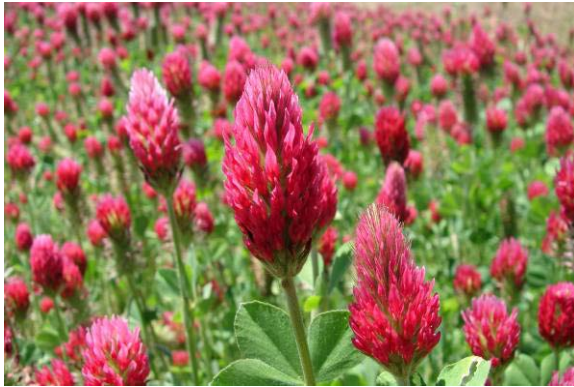
USDA NRCS Jimmy Carter Plant Materials Center Americus, GA

Contributed by: USDA NRCS Georgia Plant Materials Center