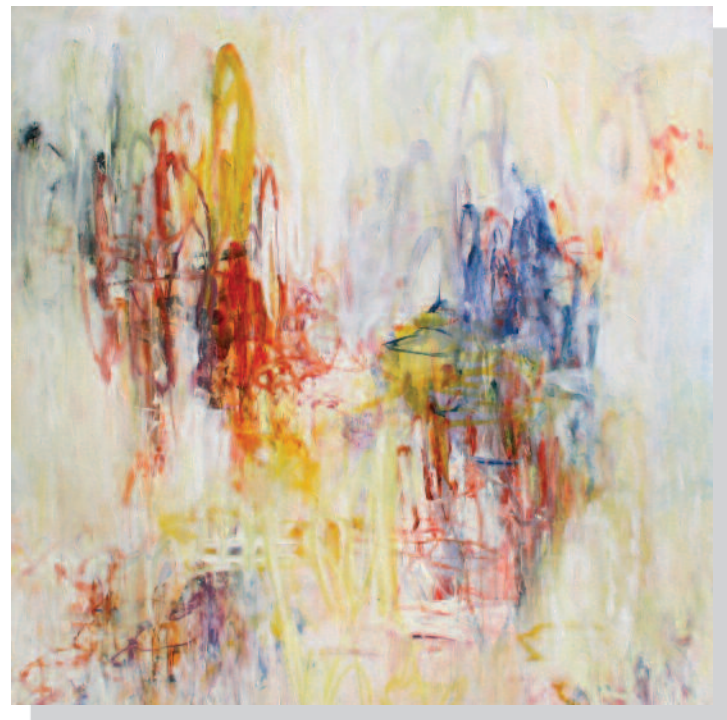
→ A Matter Of Perception I 2012 Acrylic With Cold Wax on Panel 48" x 48"