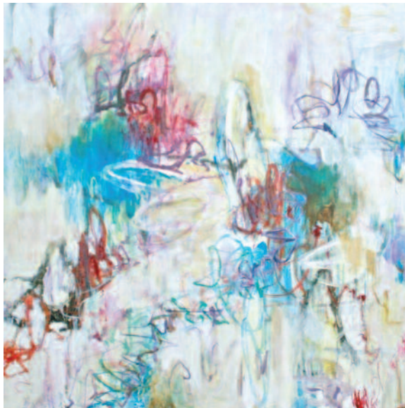
↑ Another Door Opens I 2011 Acrylic with Cold Wax On Panel 60" x 60"

"As an Abstract Expressionist painter my only tools are color, movement, and mark-making . Every color reacts with another and continues into a fluid movement; my goal is to make my imagination and the panel meet each other," Zappitell explained. "My paintings emerge from the emotion I feel in the moment my brush touches