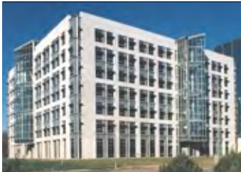
Hoffman LaRoche Inc. Nutley, NJ The Hillier Group