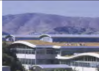
GAP Headquarters San Francisco, CA William McDonough and Partners, Architects Uses AAC SolarTrac System