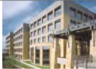
SABRE Corporate Campus Southland, TX HKS, Inc., Architects Uses AAC SolarTrac System Silver LEED Rating.