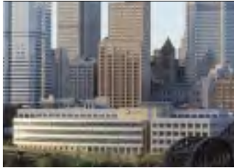
PNC Firstside Center Pittsburgh, PA L.D. Astorino, Architects Uses AAC SolarTrac System Silver LEED Rating

MechoShade® is proud to be associated with a number of successful LEED projects. Among them are: