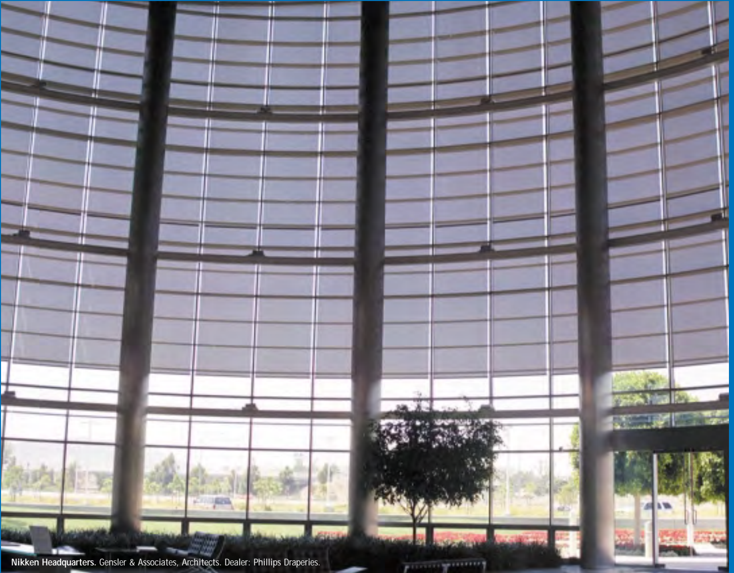
Nikken Headquarters. Gensler & Associates, Architects. Dealer: Phillips Draperies.