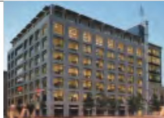
Nature Conservancy New Headquarters Building Arlington, VA HOK, Architects

For more information on MechoShades, Sustainable Design and LEED Certification, go to: www.mechoshade.com