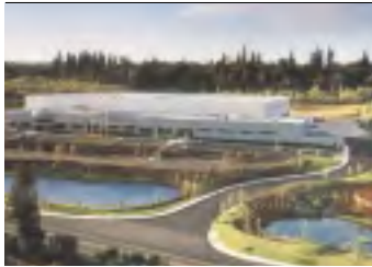
American Honda Company Gresham, OR NorthWest Regional Facility MacKenzie Group, Architects Gold LEED Rating