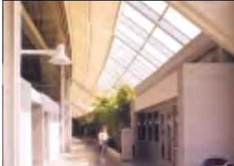
Herman Miller Holland, MI William McDonough and Partners, Architect