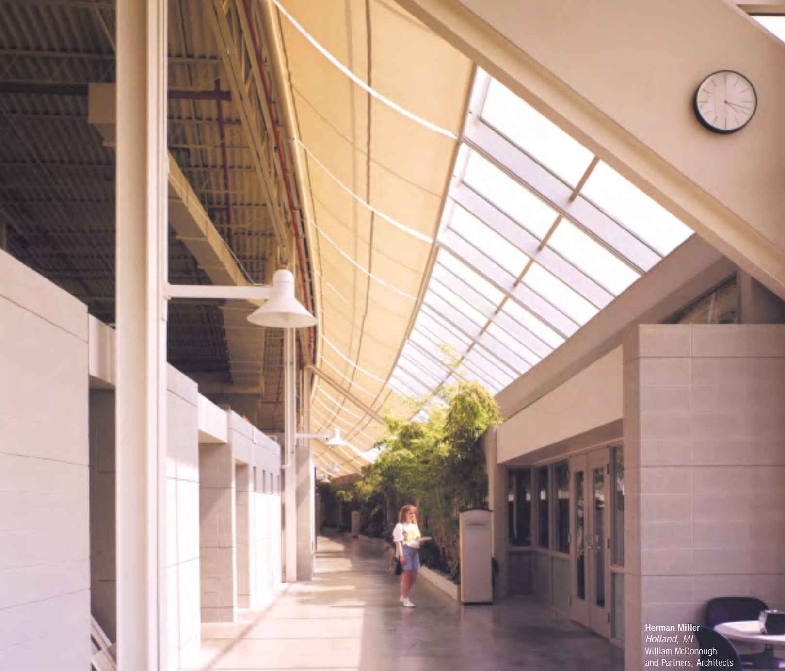
Herman Miller Holland, MI William McDonough and Partners, Architects