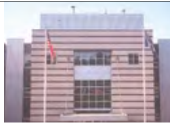
Department of Environmental Protection South Central Regional Office Building Harrisburg, PA Kostecky Group, Architects Certified LEED Rating