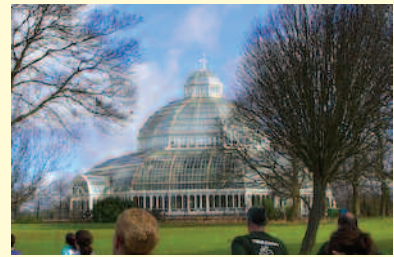
Palm House Sefton Park