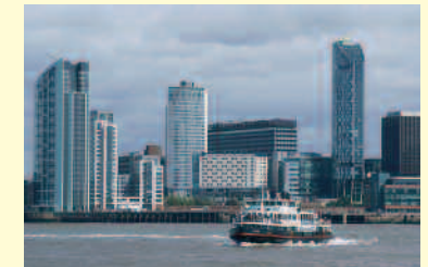
The Mersey Ferry