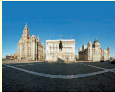
The Three Graces Pier Head