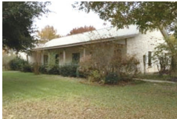
624 Krueger Canyon New Braunfels, TX 78132 Monthly Rent: $1,700

Brand new home! This home has great size with a nice open floor plan! This home offers 2 living areas, large master bedroom with a spacious walk in closet. Kitchen comes equipped with stainless steel appliances, gas stove top, and granite counter tops.