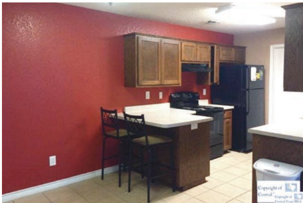
1644 W County Line New Braunfels, TX 78130 Monthly Rent: $1,250

A hill country beauty to fit your lifestyle! Enjoy the seclusion the 4.68 gated acreage, long driveway, and mature trees offer while still being within convenience of Gruene and a quality Elementary School. Work from home in the spacious 3,000 sq.ft. detached workshop/office this is equipped with a built-in phone system and internet wiring.