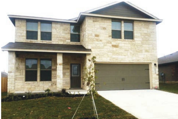
2510 Diamondback New Braunfels, TX 78130 Monthly Rent: $1,550

Prime Rental Season is Just Around the Corner!