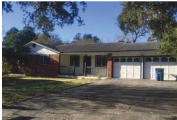
6 Ridge New Braunfels, TX 78130 Monthly Rent: $1,650

Adorable duplex! Close to schools and near IH 35. One car garage, big backyard, eat in kitchen, and wood floors in living room and master bedroom are just some of the features that make this rental amazing.