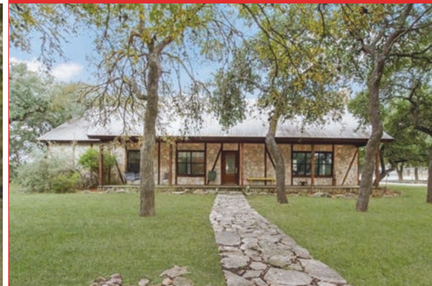
3219 Oak Hollow Drive New Braunfels, TX 78132 Residential List Price: $499,950

Nice large country home located just minutes from town. Open floor plan with wood burning fire place, large front and back porches with a great view of the country. Jack and Jill bathroom with nice sized spare bedrooms. This house features a bonus room that could be utilized as a office or extra room.