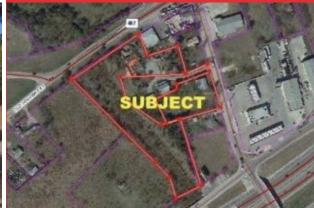
150, 152, 156 N Solms Road New Braunfels, TX 78132 Commercial List Price: $895,000

Charming rental home in a quiet established neighborhood of New Braunfels. Close to shopping, parks, and entertainment.