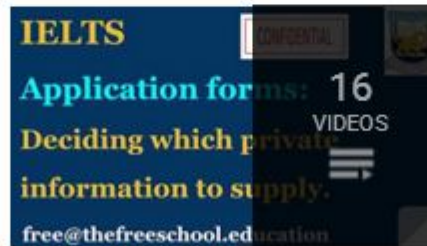
IELTS 9 PROJECT

https://www.youtube.com/channel/UC_K5RL7sRzU7T3IbGlSzpaw