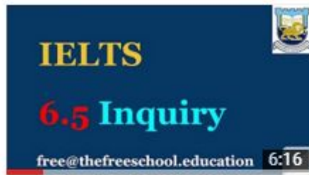
IELTS band 6.5 Inquiry 19 views • 2 days ago