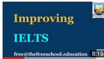
IELTS flaws : improving the design and administration policies 18 views • 2 days ago