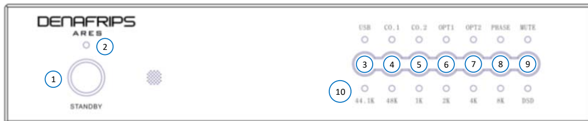
Figure 1. Ares Front Panel

The Ares is easy to use. Nonetheless, DENAFRIPS advice to read this section to fully understand the functions and features available.