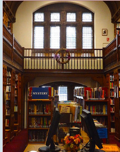
Funding for the restoration was made possible by a grant from the Valley Community Foundation and by the Friends of the Ansonia Historical Commission