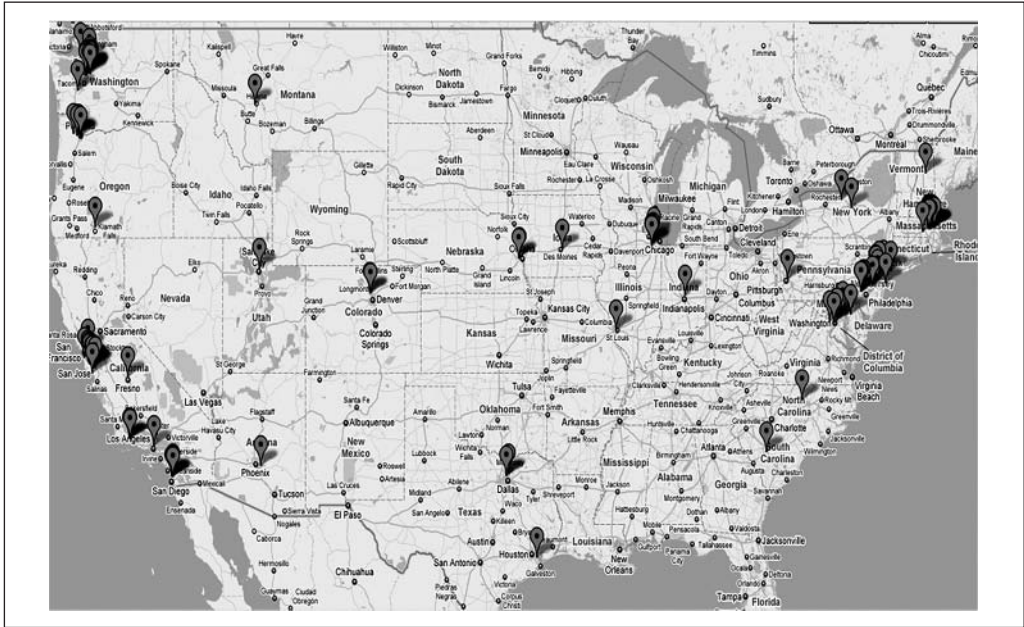
Figure 1. Geographic Distribution of Randomly Sampled In-depth Interview Candidates Note: The sampling frame is U.S. residents holding two or more patents in the automatic speech recognition (ASR) industry between 1970 and 2005.

Following Strauss and Corbin (1990), I selectively coded interview transcripts while remaining open to new insights. Coding was performed using Atlas.ti software version 5. Because circumstances surrounding a non-compete may vary by job, I chose the worker–firm dyad (i.e., job), rather than the worker, as the unit of analysis. The 52 inventors interviewed had held jobs at 78 different firms, for a total of 116 dyads. For six of the dyads, interviewees could not remember whether the employer had included a non-compete in the employment contract. I discarded these, leaving 110 dyads from 46 interviewees for analysis.