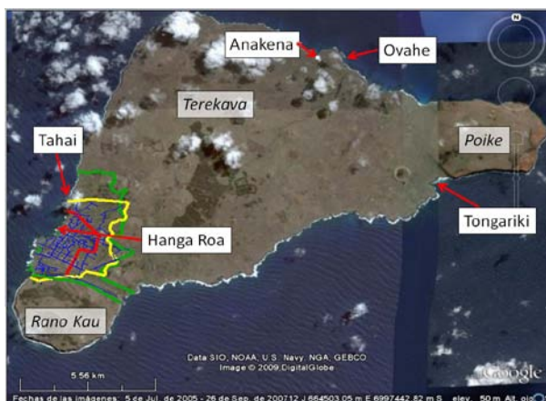
Figure 1 Location of the Hanga Roa settlement (yellow boundary), high risk coastal sites (red arrows) and locations of the island forming volcano's ( italic ).

Stakeholders on the island were distressed to learn of declining precipitation projections for 2100 especially in the light of current deficiencies in drinking water quality and groundwater aquifer supply capacity. Groundwater recharge volumes are likely to decrease by up to 50% annually with greater evaporation than precipitation exacerbating this decrease during summer. The impacts of sea level rise on fresh groundwater supply warrants detailed investigation.