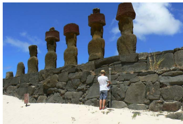
Figure 2 Example of seaward Ahu wall with standing Moai statues at Anakena Beach.

Shoreline profiles from a depth of 50m offshore to 10m above mean sea level were collated from nautical charts [9] and a field survey performed during the field trip. Equipment used for the field survey was a Sokkia SET550RX total station for the Hanga Roa profile and Leica SR50 differential GPS kindly loaned from the Chilean Lands Office for the three other sites. Wave setup and runup results are presented together with the Ahu seawall base and crest elevations in Table 3. All elevations are given relative to the local chart datum, nivel de reducción de sondas (NRS). The runup values given in Table 3 are considered conservative. The walls are composed of dry stack basaltic slab structure as shown in Figure 2.