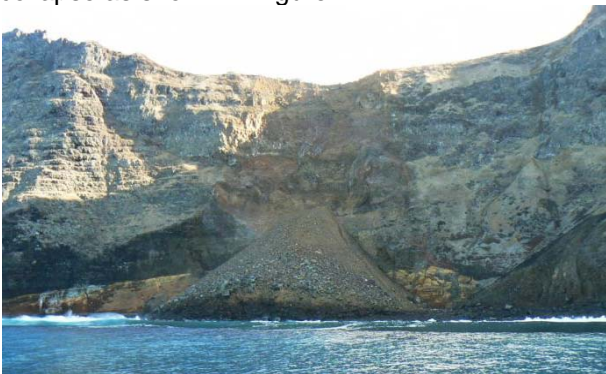
Figure 4 Southern sea cliff of Rano Kau showing undercutting and a large collapsed section.

Cliff instability was identified during stakeholder consultation as a significant risk under the current climate. In 2008, a 100m wide section of the 300m high southern sea cliff of the Rano Kau crater collapsed. Orongo, one of the most significant cultural, archaeological, and tourist sites (containing ceremonial stone houses and petroglyphs) is located on the cliff edge only 400m to the west of the 2008 collapse. Inspections of collapses along the sea cliffs surrounding Rano Kau were made by Chilean Armada (Navy) patrol boat. The geologic stratigraphy showed significant layers of ash and breccia intermingled with fractured basaltic layers. This potentially unstable geology is reportedly common in all sea cliffs around the island. Until the mechanisms for sea cliff instability are better understood, the degree to which climate change may exacerbate the existing issues cannot be quantified. As sea level rises, high energy waves may be able to deliver greater energy to the cliff bases increasing the rate of under cutting of the cliffs. It was evident that undercutting had occurred underneath the 2008 collapse as shown in Figure 4.