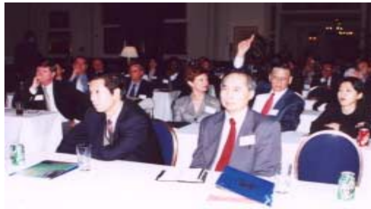
Attendees are active in exchanging ideas.