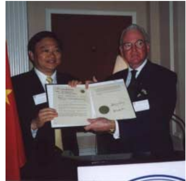
Alderman Edward Burke, Chairman, Chicago City Council Committee on Finance presented the Hon. Yu Youjun, Mayor of Shenzhen, the City resolution naming June 16, 2001 "City of Shenzhen Day"