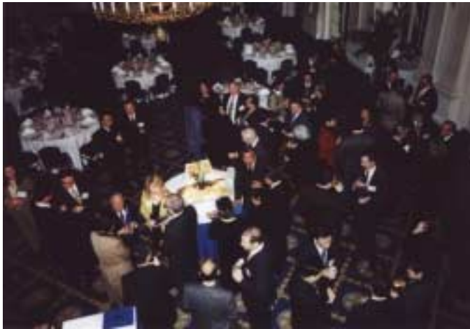
USCCC events provide opportunities to meet potential business partners