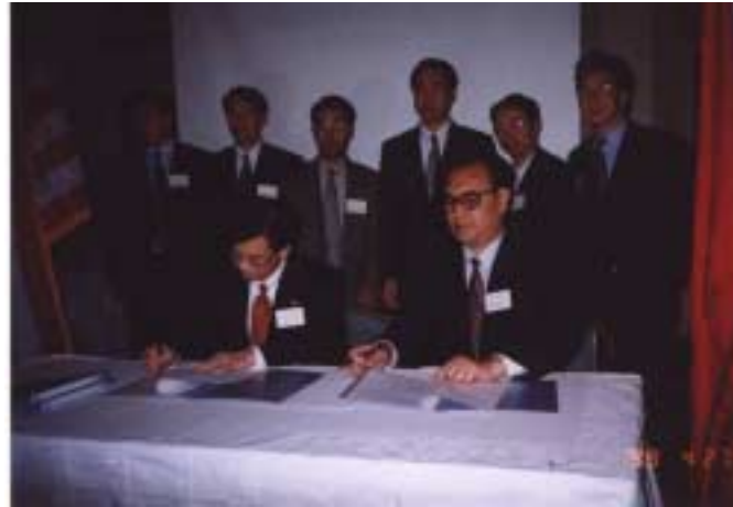
USCCC witnessed the Signing Ceremony for the Investment Cooperation between Bright Ocean Corporation and Dalian, Liaoning Province