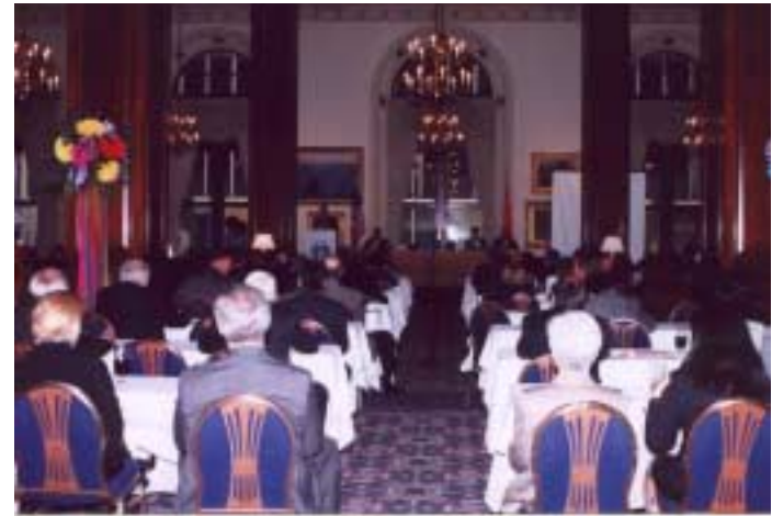
USCCC events are always thought-provoking and well attended.