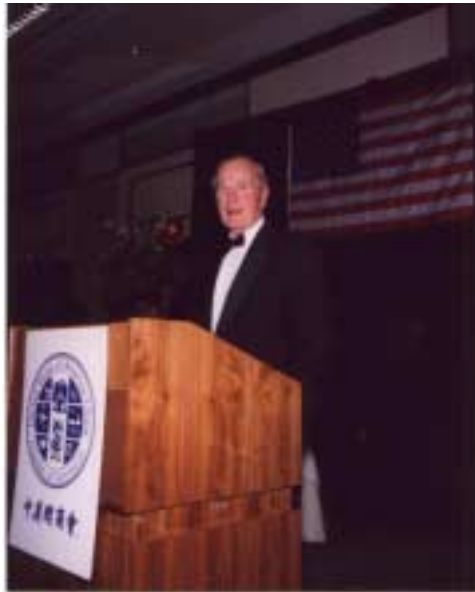
President George H.W. Bush discussed the U.S.-China Relationship