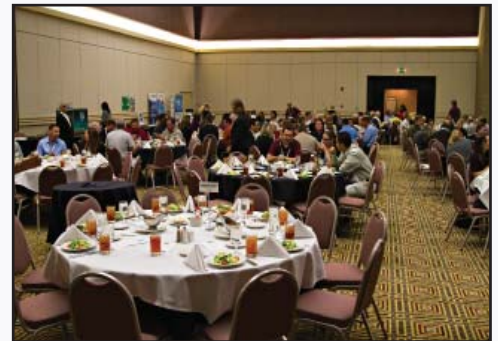
Above: Annual Leonard Bronstein Award's Luncheon in the exhibit hall