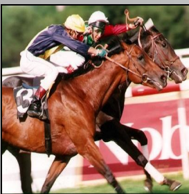
Winning by a nose is still winning!

That being said, Delaney Insurance wants to thank you for your business and your trust! You will be seeing us and hearing about us more in our community. We Care!