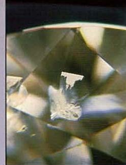
Figure 2: The same two laser-drill channels from figure 1, in transmitted light.