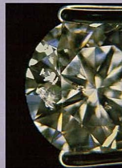
Figure 4: The two inclusions near the girdle have been treated by this new technique. They probably looked very similar to the two brown inclusions under the table before treatment.