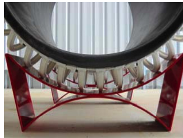
Example of bow configuration on large diameter heavy weight pipe.

**Note : For pipe greater than 800mm OD, for heavy weight pipe, or if the pipe material is slippery, it is recommended that stainless steel banding be applied over the collars. Contact kwik-ZIP for further information.