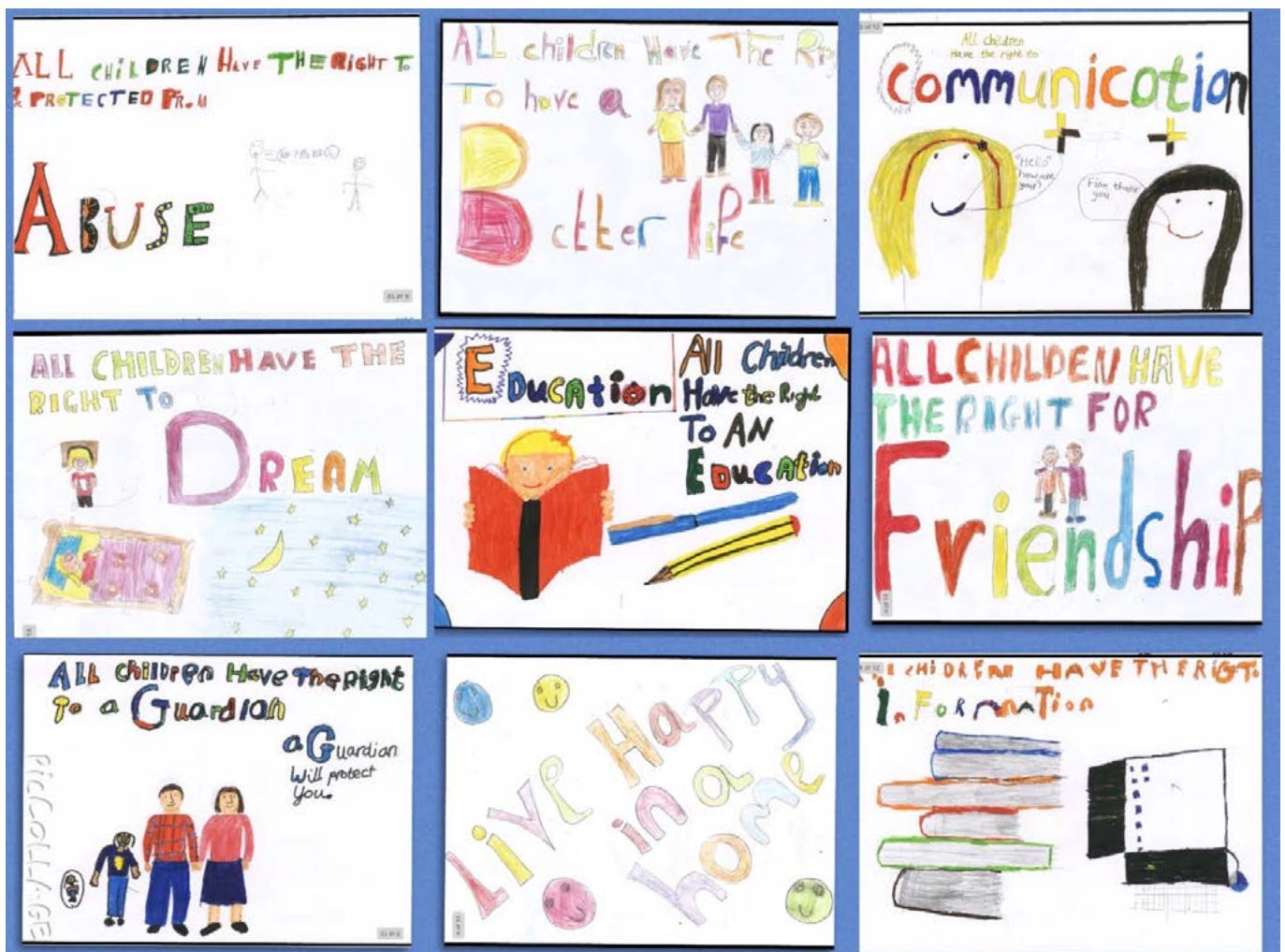
Artwork from pupils at Frances Olive Anderson Primary School and Mohammad Shamel School, Beirut, Lebanon

Ask your pupils to find out who is their Member of Parliament and Member of the European Parliament. Perhaps they could contact them to find out what their opinions are on the issue of migrants and refugees? If your pupils disagree with their opinions, or feel strongly about this issue, they could write to them expressing their views.