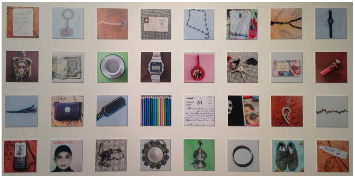
Photographs of precious objects brought from Syria, from the Syria: Third Space Exhibition

Bring in an object that is precious to you concealed in a bag or box. Tell your pupils that they have ten questions to try and work out what the object is and why it is precious to you. You can only reply yes or no to their questions. Reveal your precious object to the class and explain its significance to you.