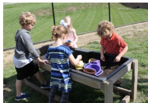
Good old dirt always brings out the creative side in everyone!

It's always fun when parents get to come out and play!