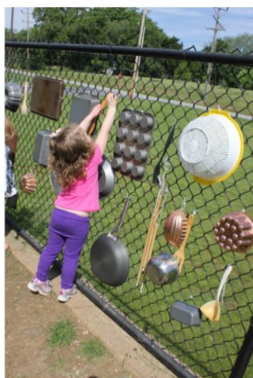
A "Percussion Orchestra" provided the Music!!