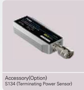
Accessory(Optional) S134 (Terminating Power Sensor)