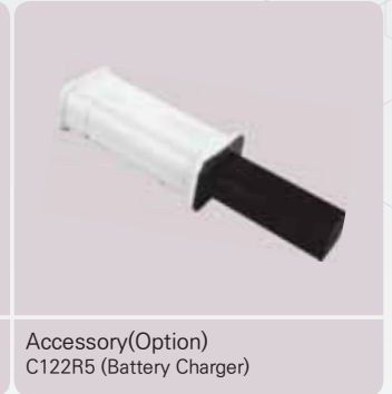
Accessory(Optional) C122R5 (Battery Charger)