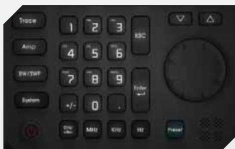
Keypad with Knob