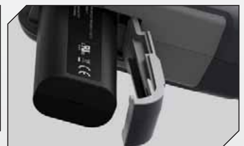
Smart Battery (8 hours)