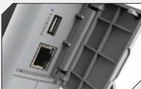
Interface (USB, LAN)