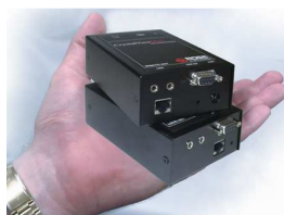
Small in size, loaded with features

The Serial/Audio model allows stereo audio to be transmitted in either direction across the CAT5 link simultaneously. Many serial devices like a Touchscreen can plug directly into the serial port on the Remote Unit. The Mini model is small in size but loaded with state of the art technology. It is ideal for extending the distance between a CPU and a KVM station (up to 150 feet).