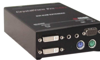
CrystalView DVI Fiber (PS/2 model)