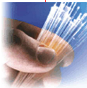
Fiber makes extended distances easy to reach

All models are available with both transmitter and receiver KVM access. The transmitter's KVM access allows an additional KVM station to be connected to the transmitter unit. If your system requires dual video, the CrystalView DVI Fiber dual video model can fully support it.