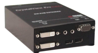
CrystalView DVI Fiber (USB model)