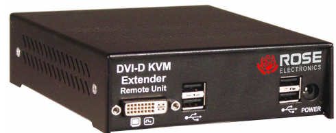
Rear View single / dual Link – single Video – USB 2.0