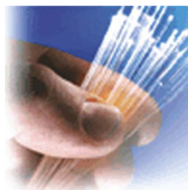
Fiber makes extended distances easy to reach

If your system requires dual video, the CrystalView DVI Plus dual video model can fully support it.