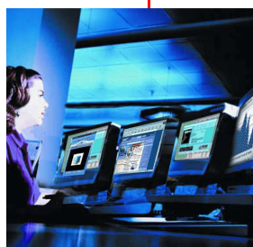
View single, or dual, video 1,000 feet away

The bi-directional serial option allows you to connect a touchscreen, digital tablet, serial printer or other supported serial device to the remote location. No set-up is needed; just connect the serial device to the serial port and it's ready to use.