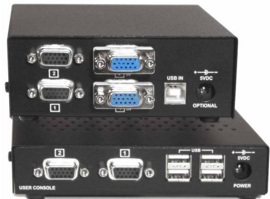
Rear view Local / Remote units Dual Video