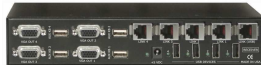
Receiver With auxiliary USB Keyboard input