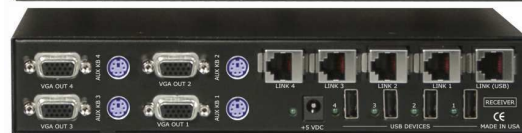
Receiver With auxiliary PS/2 Keyboard input

NOTE: Aux keyboard input (USB or PS/2) are for video adjustments only.