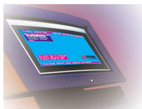
UltraView Pro on-screen menu

With its advanced on-screen menu system, built-in security, flash memory, easy expansion, front panel controls, and other features you start to get a sense of the UltraView Pro advantage.