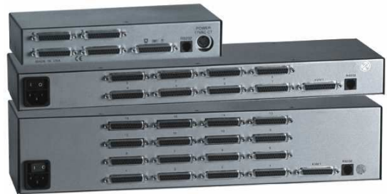
Rear view of UltraView Pro, 1x4 top, 1x8 middle, 1x16 bottom