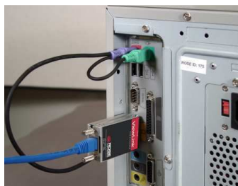
Connect the transmitter directly to a PC's Video, keyboard, and mouse ports