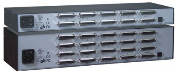
Rear View - MPB-4U2V (top) / MPC-4U4V (bottom)