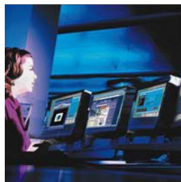
Perfect for Trading Room Floors

Call us today to find more about the MultiVideo's unique capabilities.