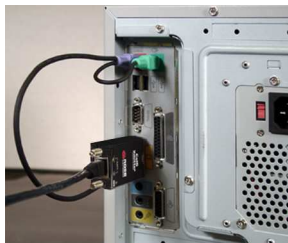
Direct connect CAT5 Transmitter streamlines your installation

Europe and Asia, Rose provides a full range of capabilities and support. Call us today for more information about this and other Rose products.