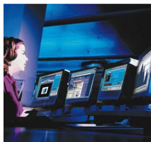
Independent or simultaneous switching of KVM and peripherals

The MultiVideo DVI can be connected to an additional unit and synchronized to switch video from multiple computers. When a switching command is sent to the master unit, it sends the same switching command to the secondary unit. Both units are switched to the same CPU port and video is displayed on all of the connected monitors.