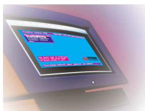
UltraView Remote on-screen menu

With its ability to access your computers and servers locally or over IP, its advanced on-screen menu system, built-in security, flash memory, easy expansion, and other features, you start to get a sense of the advantages and applications that the UltraView Remote 2 can provide.