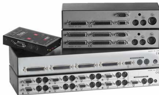
Rear view of Vista models KVL-8PCA, KVL4UA, KVT-2PC, KVM-4UPH, KVM-2UPH