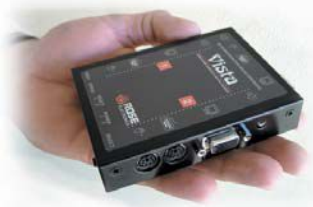
Vista-mini has Hi resolution video and stereo audio

Call us for more information on this excellent family of full-featured, easy-to-use, and economical KVM switches.