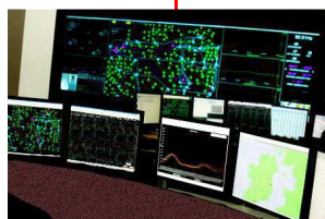
Extend quad video up to 33,000 feet over singlemode fiber cable

All models are available with both transmitter and receiver KVM access. The transmitter's KVM access allows an additional KVM station to be connected to the transmitter unit.