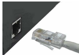
Standard CATx cable

The CrystalView DVI Mini extender supports a wide range of USB HID devices. All standard 2 button, 3 button, and wheel mice and all standard keyboards are supported. Other HID devices such as touch-screens, graphic tablets, barcode readers or similar HID devices may function properly but are not guaranteed. The CrystalView DVI Mini only supports a maximum of two USB HID devices.