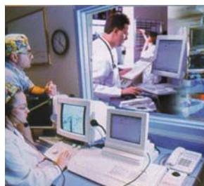
Medical or dental personnel access a computer from multiple locations

The MultiStation has a variety of other features to fine-tune your application. Call us to find out how the MultiStation can simplify your computer access.