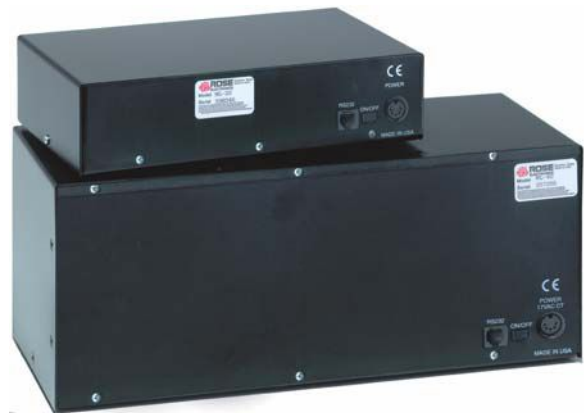
Rear view of MultiStation models ML-2U and ML-4U