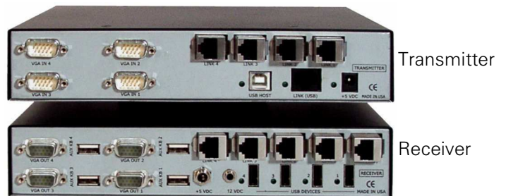
Rear view Quad Video Model