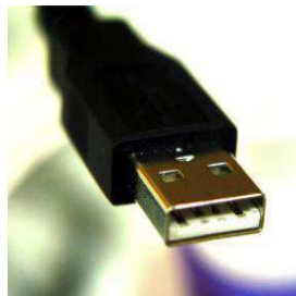
Extend your USB device up to 330 feet over industry standard CAT5 cable

Locate a video monitor(s) in remote control areas, classrooms, conference areas, video studios, and present the video from a computer 330 feet away. The +5VDC power adapter is required for both transmitter and receiver. The +12VDC adapter is required for the receiver and optional for the transmitter.