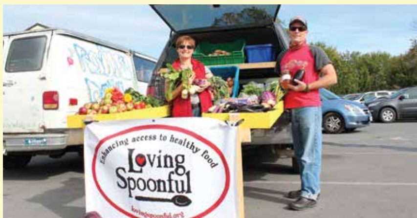
"Loving Spoonful makes me feel hopeful. I was honored to work with such a dedicated, serious, and, above all, fun group of people!" - Loving Spoonful Volunteer