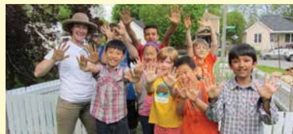
"I love this program so much! Everyone you bring in is so knowledgeable and enthusiastic. I'm thrilled to have my class be a part of this." - Teacher involved in the GROW Project