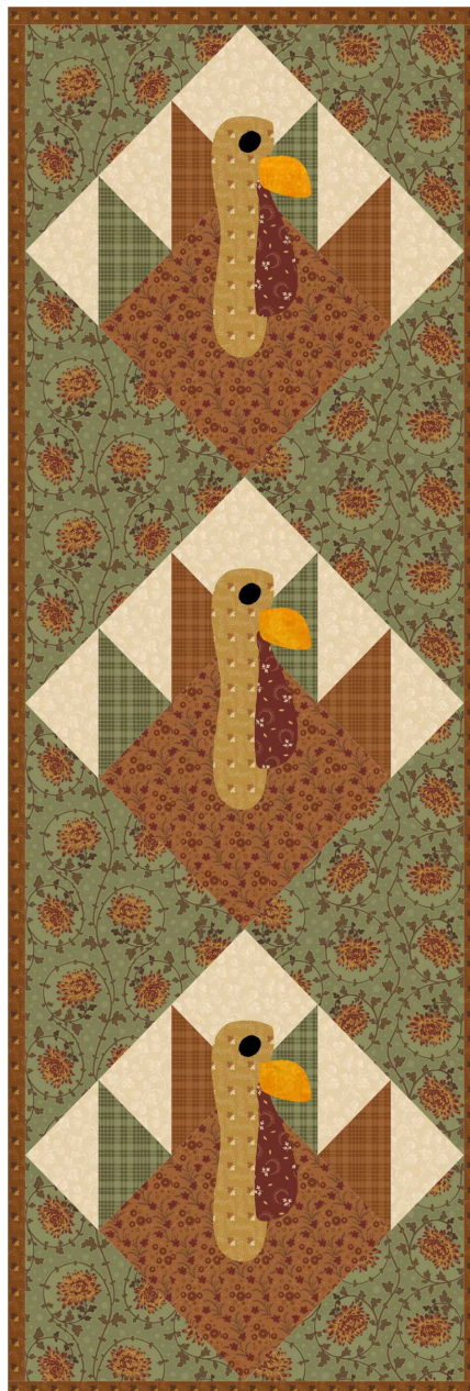
Table Runner (as shown)