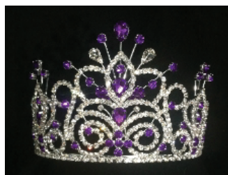
Division Princess Crown

Side award winners in each division (best eyes, best smile, best hair) will receive a custom Star One Medal.