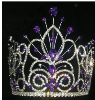
Supreme Queen Crown