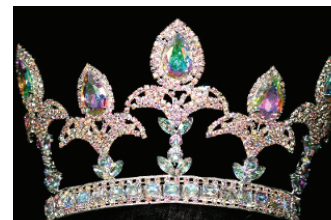
Supreme King Crown