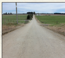
Gravel Road (44%)