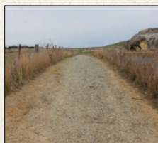
Smooth Shingle (9%)