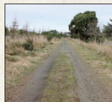
Dirt (less than 1%)