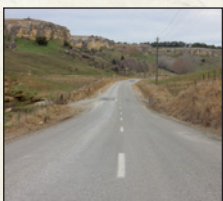
Sealed Road (47%)