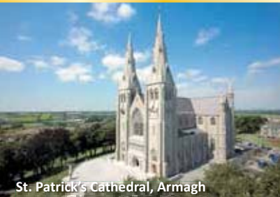
St. Patrick's Cathedral, Armagh