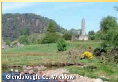
Glendalough, Co. Wicklow