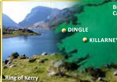
Ring of Kerry