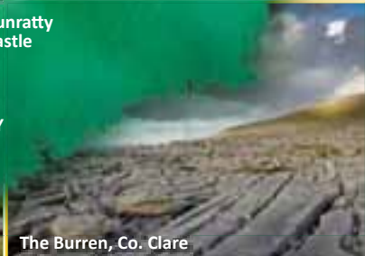
The Burren, Co. Clare