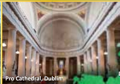
Pro Cathedral, Dublin