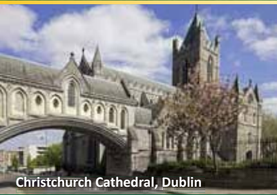
Christchurch Cathedral, Dublin