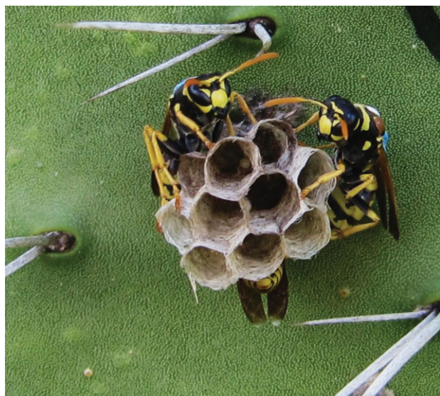
Figure 1. Newly founded nest of Polistes dominula on a cactus at our Spanish field site, with three individually marked co-foundresses. (Online version in colour.)

the offspring of another individual known as the queen or dominant. The defining feature of these societies, however, is that all individuals, including the helpers, are potentially capable of mating and independent reproduction. Primitively eusocial societies have therefore been the key testing grounds for theories concerning the origin of eusociality. Given that all individuals can potentially reproduce directly in these societies, cooperation between non-relatives seems intrinsically more likely to be evolutionarily stable. In this review, after a brief introduction to primitively eusocial wasps, we first document the occurrence of unrelated co-foundresses in paper wasps ( Polistes ). We then address two major questions: (i) why do some females become non-reproductive subordinates with unrelated nest-mates; (ii) why do these unrelated subordinates participate in costly helping behaviour? We consider both ultimate and proximate (mechanistic) answers to these questions.