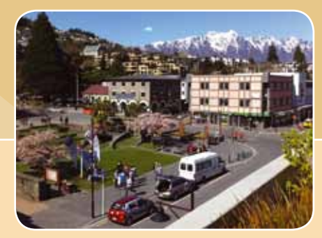
View from Queenstown Campus