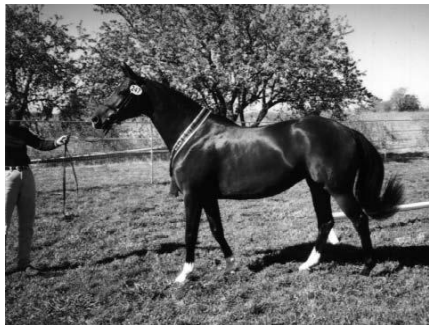
Example of Horse in 'Open' stance

Scoring: At the conclusion of the evaluation, Weanlings and Yearlings receive one score for conformation/type and a second score for quality of movement. The sum of these two scores is used to award either merit status (12-14 points) or premium status (15+ points) to the foal or yearling.