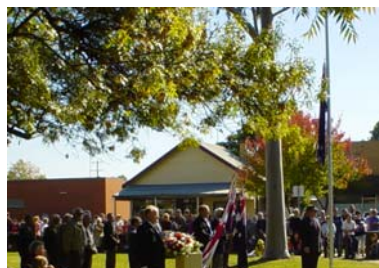
Tatura Male Choir began singing at Tatura's Anzac Day Service in 1953 and continues to this day. Groups also sing at Mooroopna's service.