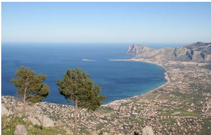
View over Cinisi, Sicily