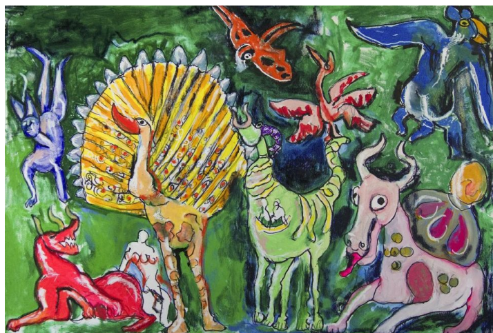
"Darwin" by Dario Fo', Exposition at the Palazzo Ferrero in Biella, Italy