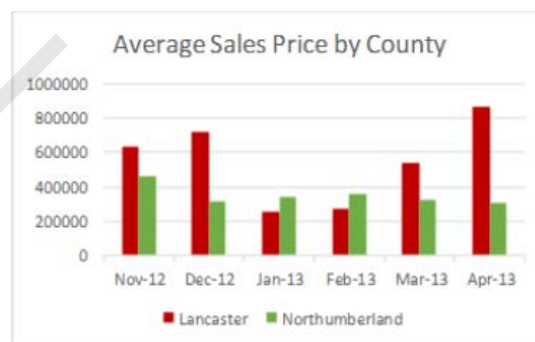
Figure 2: Monthly Average Sales Price of Waterfront Home sold in Lancaster and Northumberland from November 2012-April 2013.