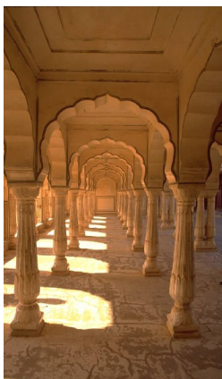
"For the gate is narrow and the way is hard,..." Matthew 7:14