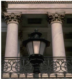
Be the light that shines in Jesus' eye.