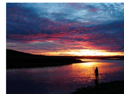
Fiery sunset on a perfect Patagonian evening.