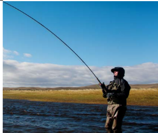
A fly fishing moment — a fish on the big rod.

We position ourselves just as it is getting dark and I start to fish the run. The fly is getting deep and bumping some boulders on the bottom, occasionally catching a bit of weed on this side of the channel. I am working slowly down towards the hot spot when the fly snags on the bottom. I pull on the rod, and then I pull on the rod a couple more times to try to