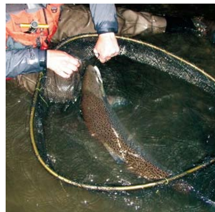
I wondered why the nets were so big!

Memorable too is the 12-pounder hooked on the very first cast of the last morning, having tried to get the fly onto the water by using three false casts directly into the wind up the bank, then releasing on the back cast towards the water. Actually landing a