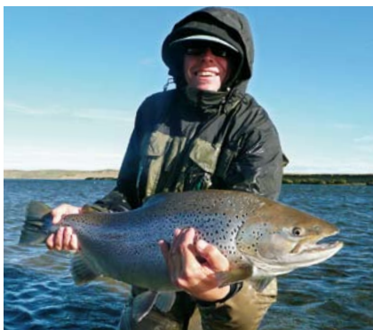
Cradling the sea trout of my dreams.

My time on the Rio Gallegos Chico ends with the sun dropping too low to see into the water. Nacho and I head to the main river for the magic hour. Nacho is keen for me to try for the living rock fish of the previous night but my heart is not in it and the run ends quickly. I am keen to fish Abbots to finish my unsettled business from the very first night, and four casts into the run I bring a 67 cm fish to the net,