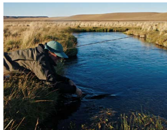
Releasing a spring creek resident.

The big rod helps with the sudden lunges and headshakes as the diesel I have hooked casually makes its way upstream. I am thankful for the 15 lb tippet. I start thinking of what it would be like to hook this thing on a 9-ft single-handed rod; my brain quivers and I get on with the task at hand. The fight draws down, the colour in the water makes netting difficult, but suddenly, there it is in the net. I cannot believe what I am looking at. The bottom of the net is full, the fish looks incredible: a silvery hen with a small head, a fresh-run fish on her way upriver to spawn. Nacho weighs the fish and I measure it—20 lb and 86 cm.