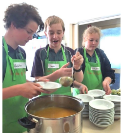
Year 8 Students from Strathalbyn Christian College during their Service Week.

During Strathalbyn Christian College's community service week we enjoyed having six Year Eight students and their teacher join us for a morning and assist in setting up and serving the lunch. This week we varied the menu with soup followed by a sausage sizzle and salad then ice-cream in cones.